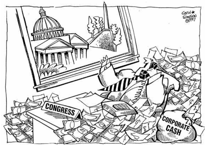
"I'd love to meet with your Union Committee... but right now I'm buried in paperwork."

Brothers and sisters as we have reported before: the Company doesn't care.